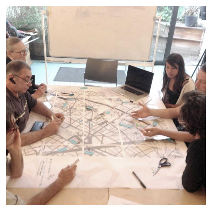
Figure 2. <u>Cartographic workshop of the 6<sup>th</sup> of July 2017</u>: identifying the future (physical) urban transformations.

In this final step, the two groups of participants join. One group presents the work to the other group alternatively. A discussion follows. The objective is first to share the workshop experience including the knowledge about the urban transformations and, secondly, to leave room to the spontaneous formulation of possible responsive strategies to implement.