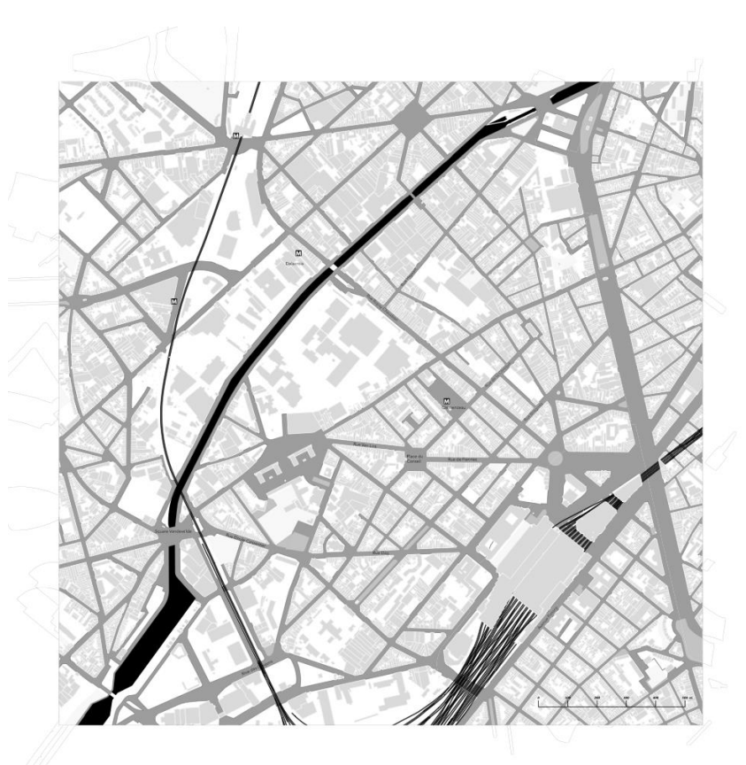
Figure 1. The basic map of Cureghem used for the cartographic workshops.